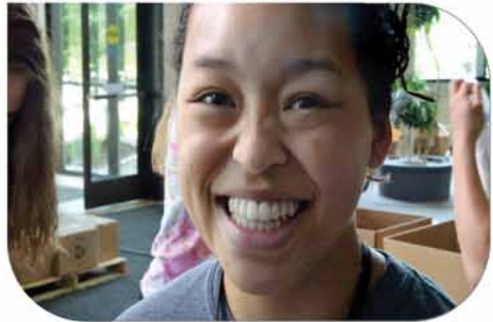
A Youth Academy volunteer happily expressed her motivation for volunteering at our Hygiene Packing Kit Event.

There is something so heartwarming and encouraging to see these wonderful children work with such delight, smiles and laughter—all the while learning to glorify Christ by serving those in need.