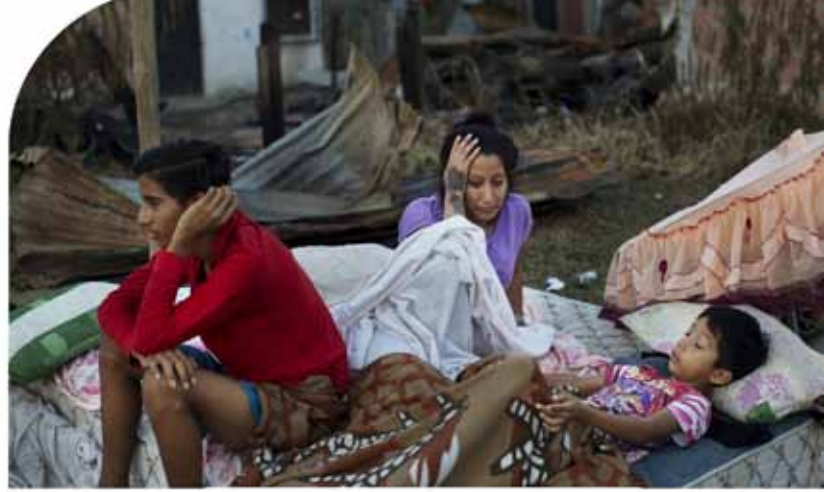
A family from Manta, Ecuador wakes after sleeping outside, their home destroyed from the earthquakes.

We are very grateful for our amazing donors who gave so generously. They made it possible for