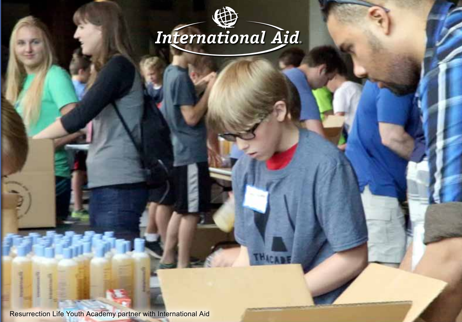
Resurrection Life Youth Academy partner with International Aid